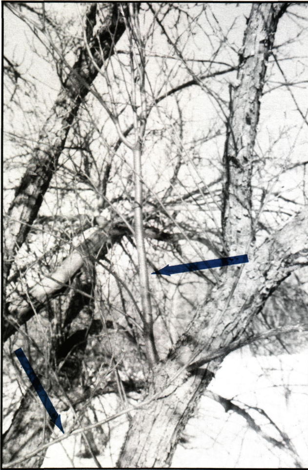
Figure 2. An unpruned, abandoned apple tree showing several water sprouts (new growth within the past 2 to 4 years). Note the smooth bark on these limbs. Older limbs have scaly bark. Leave some of this young growth to begin the new tree structure.

careful that they do not break off the shoots you intend to leave when they fall to the ground. When making the severe cuts on old limbs, try to cut them more or less perpendicular to the ground. Cuts that face upward will collect and hold water from rainfall, causing ice damage in winter and decay in summer. Paint these large cuts with white outdoor latex paint within a few days to protect the wound from the weather. Outdoor white latex paint is not toxic to the tree and seals moisture out, preventing decay.