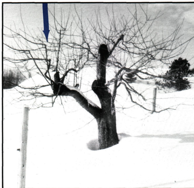
Figure 7. A renovated tree after three full growing seasons. Note the productive capacity of this "rebuilt" tree. Also note where cuts have been made to force outward rather than upright growth.