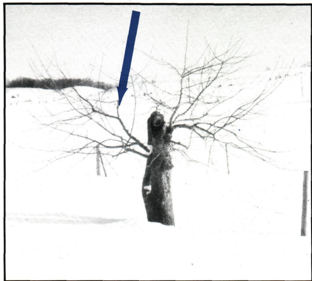
Figure 4. A renovated tree two growing seasons after major limbs were removed. Note cut made on upright growth to force outward growth.

original tree. All the growth on this new tree is also quite vigorous and will produce good crops of large, high quality fruit. The reduced tree size will also make the tree much easier to spray and manage (Figure 7).