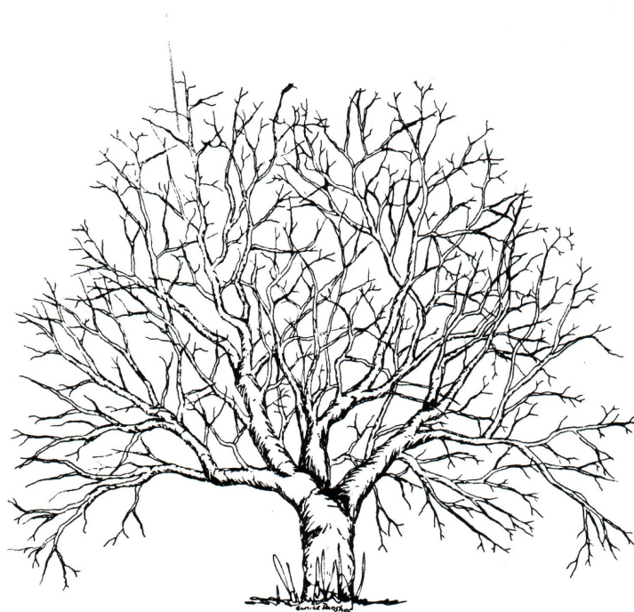
Figure 1. The typical abandoned apple tree is very tall with many weak and dead or dying interior limbs.

Study the main limb structure of the tree closely before deciding where to make cuts. Try to locate some relatively new water sprout-type of