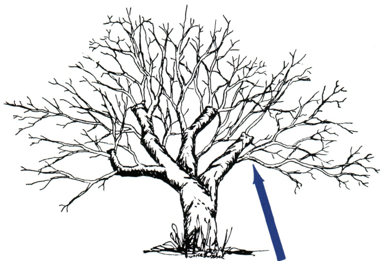
Figure 6. By the spring of the third season, the tree has now produced many new, vigorous branches and is capable of producing a small crop of fruit. Note that many of the small limbs left the first spring have developed to relatively large, productive structures.